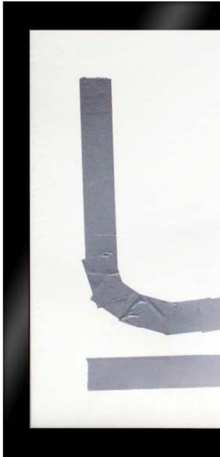
LG WILLIAMS, Duct Tape US! 24" x 36", 2003, Duct Tape on Paper Edition of 5 © 2003 LG Williams and The Estate of LG Williams Courtesy Linc Art Gallery and The Artist. All Rights Reserved.