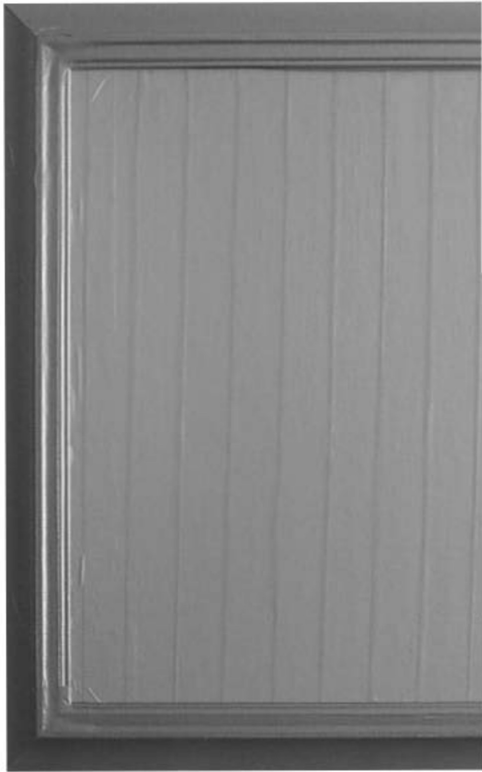
LG WILLIAMS, Duct Tape Rectangle or Improvisation in Duct Tape 30" x 40", 2003, Duct Tape and Frame Edition of 5 © 2003 LG Williams and The Estate of LG Williams Courtesy Linc Art Gallery and The Artist. All Rights Reserved.