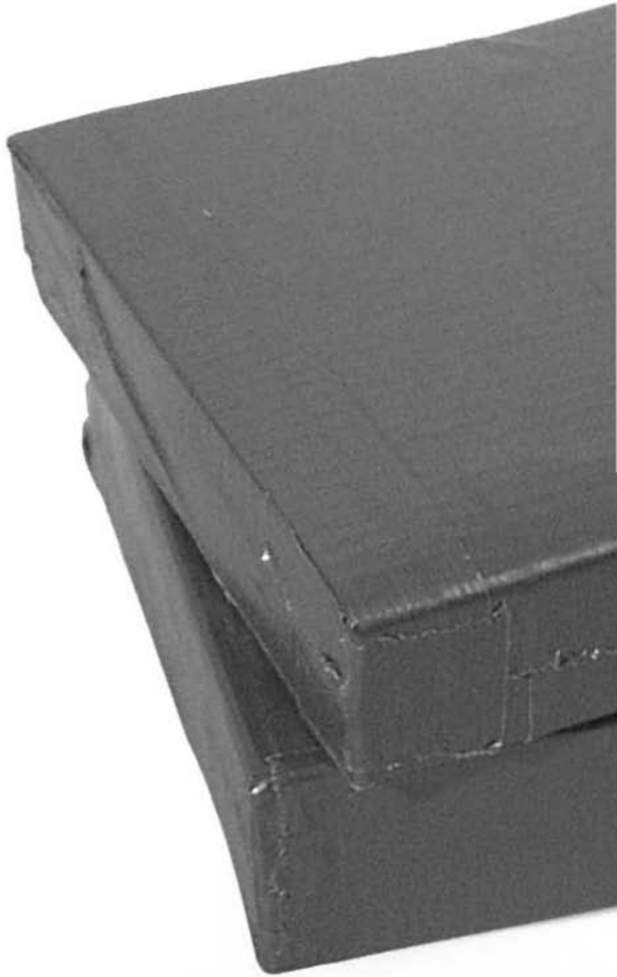
LG WILLIAMS, Old and New Testament Dimensions Variable, 2003, Duct Tape, Old and New Testament Edition of 10 © 2003 LG Williams and The Estate of LG Williams Courtesy Linc Art Gallery and The Artist. All Rights Reserved.