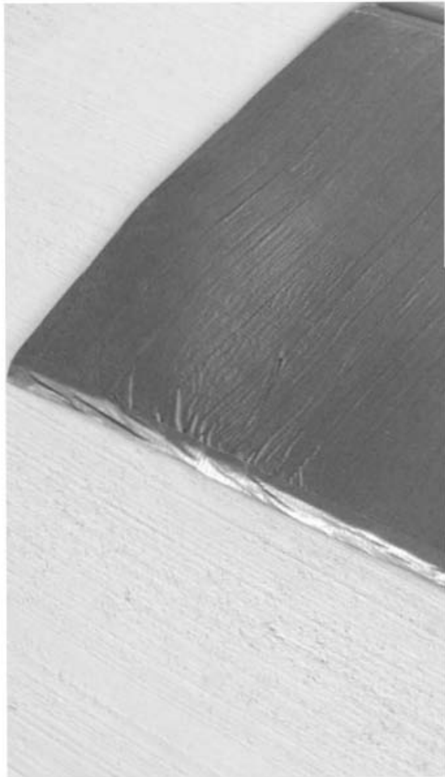
LG WILLIAMS, Duct Tape Welcome 20" x 30", 2003, Duct Tape and Door Mat Edition of 10 © 2003 LG Williams and The Estate of LG Williams Courtesy Linc Art Gallery and The Artist. All Rights Reserved.