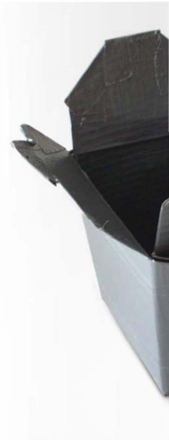
LG WILLIAMS, Duct Tape Take-Out 8" high, 2003, Duct Tape, To-Go Box and Chop Sticks Edition of 10 © 2003 LG Williams and The Estate of LG Williams Courtesy Linc Art Gallery and The Artist. All Rights Reserved.